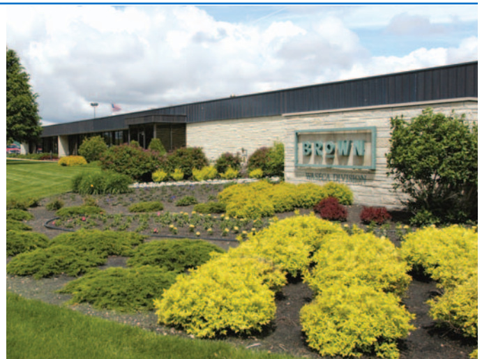
Brown Printing’s 1,000 employees produce more than 300 titles in the Waseca plant. The new Regenerative Thermal Oxidizers greatly reduce energy costs and contribute to the company’s ongoing success.

Swift payback. With energy savings higher than anticipated and the money-saving advantages of a CenterPoint Energy Custom Rebate, projected payback is now expected to be less than four years.